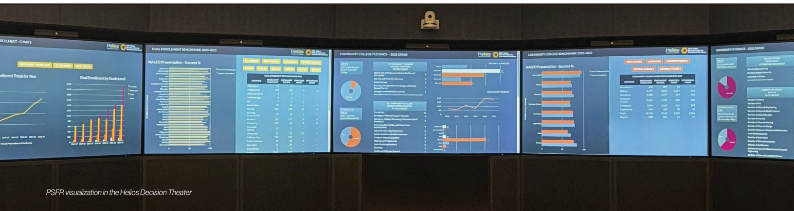
PSFR visualization in the Helios Decision Theater

Request an account at: decisioncenter.asu.edu/ tools/PSFR