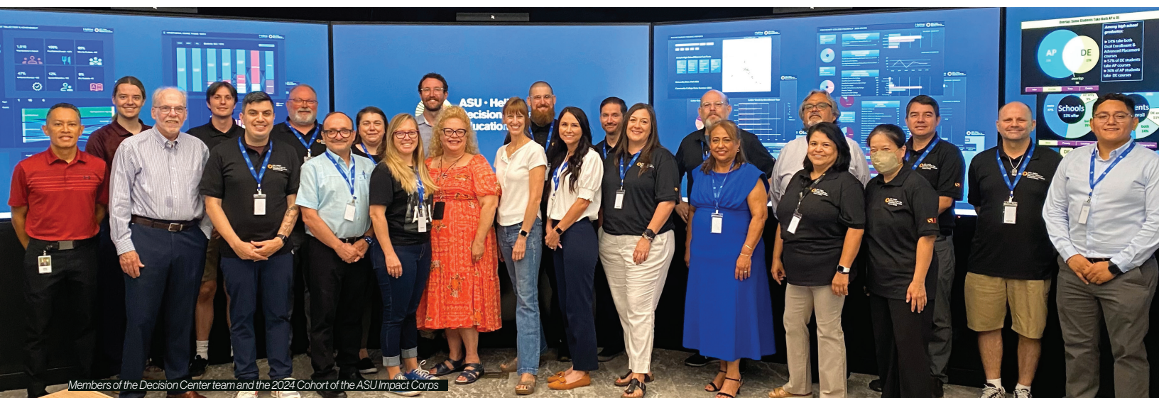
Members of the Decision Center team and the 2024 Cohort of the ASU Impact Corps

Once teachers have been chosen, they are invited to join the ASU Impact Corps. The program includes both a Summer Retreat and multiple Mentor Events over the course of the year. By bringing these teachers together in a cohort model, the Decision Center is able to connect them with resources focused on K-12 education and build a network of mentor educators across the state.