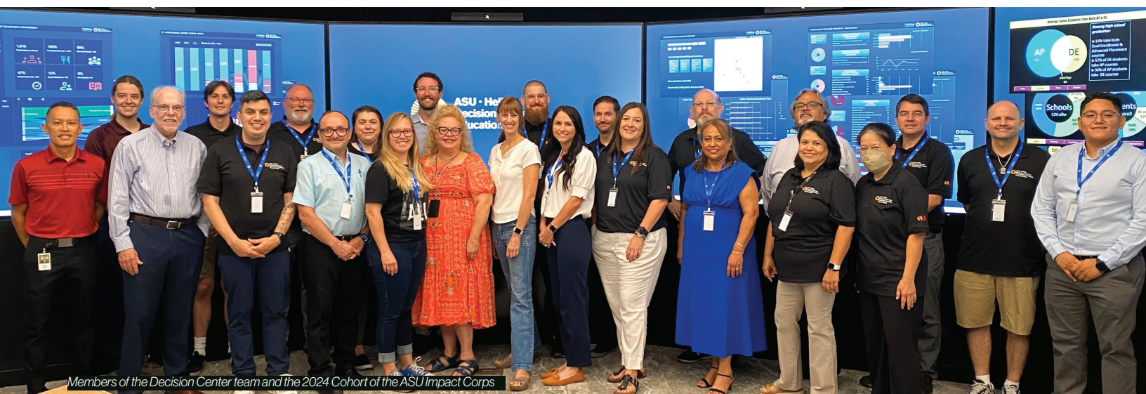
Members of the Decision Center team and the 2024 Cohort of the ASU Impact Corps

Once teachers have been chosen, they are invited to join the ASU Impact Corps. The program includes both a Summer Retreat and multiple Mentor Events over the course of the year. By bringing these teachers together in a cohort model, the Decision Center is able to connect them with resources focused on K-12 education and build a network of mentor educators across the state.